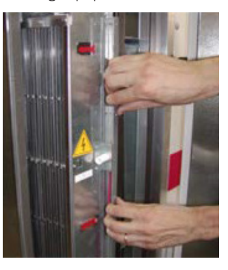
Front withdrawal version